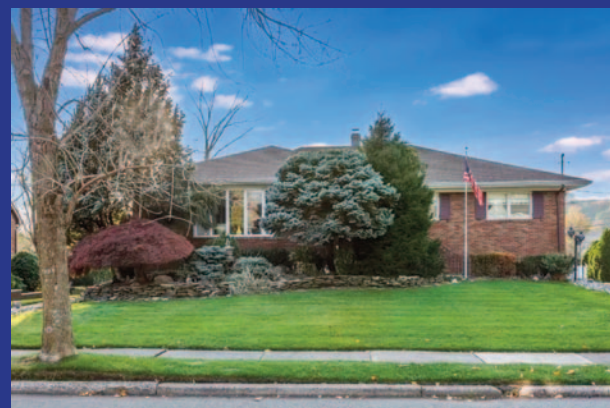
The new Murray House, coming in 2025.