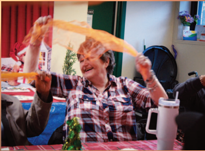
New Jersey State Council on the Arts, Sparky Seniors Program.