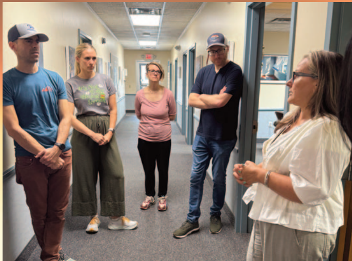
FM Kirby Foundation's team visit and tour of Hope House programs in Dover.