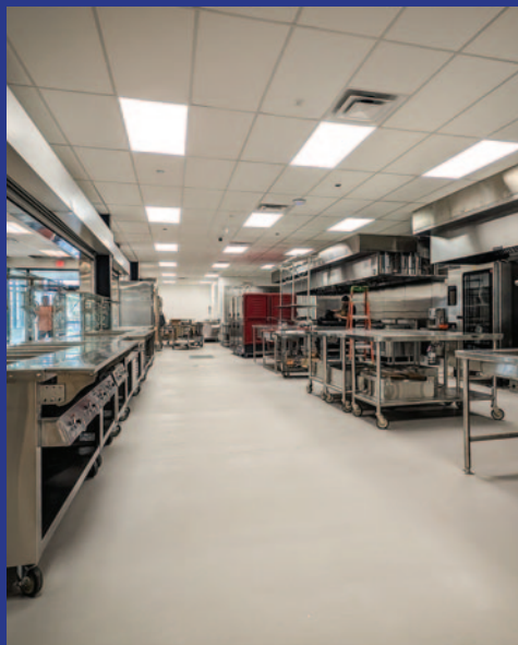
Straight & Narrow Rehabilitation Center Commercial Kitchen