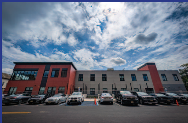
Straight & Narrow Rehabilitation Center Exterior