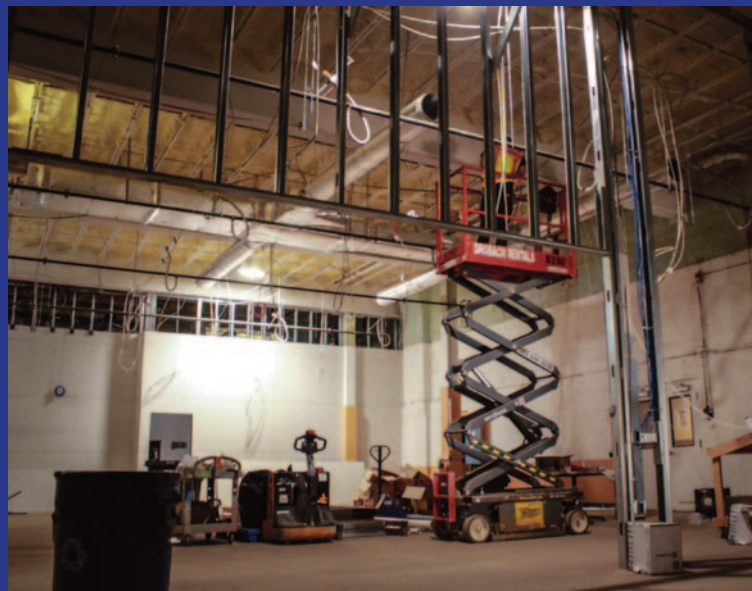
The Father English Food Pantry and Community Center, currently under construction.